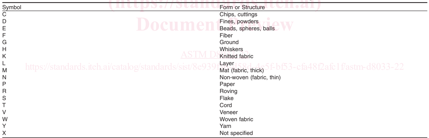
TABLE 1a Symbols for the Form or Structure of Fillers and Reinforcing Materials