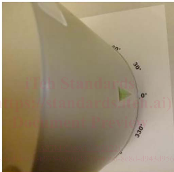
FIG. 4 Reflectometer Head's Initial Orientation is 0°