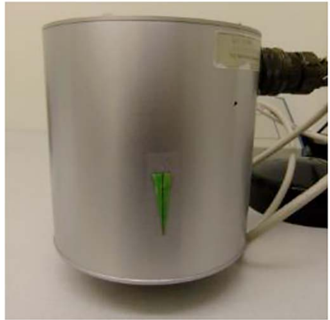
FIG. 2 Vertical Indicator Arrow Affixed to Side of Portable Reflectometer

reflectometer head, shall be used to gauge the azimuthal angle of the reflectometer head with respect to the compass markings.