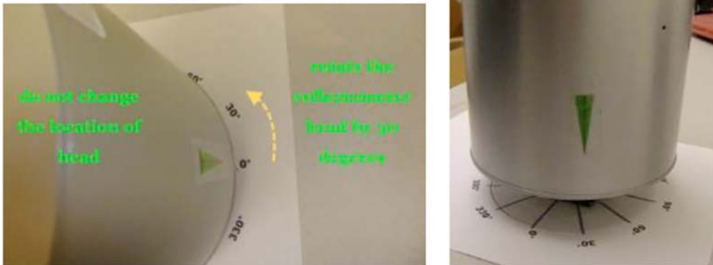
FIG. 5 Rotating Reflectometer Head by 30°