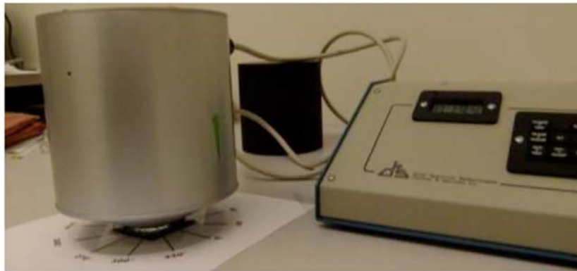
FIG. 3 Reflectometer Head Placed at Center of Specimen