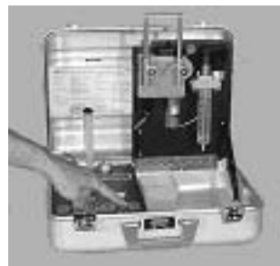
FIG. 5 Meter Adjust