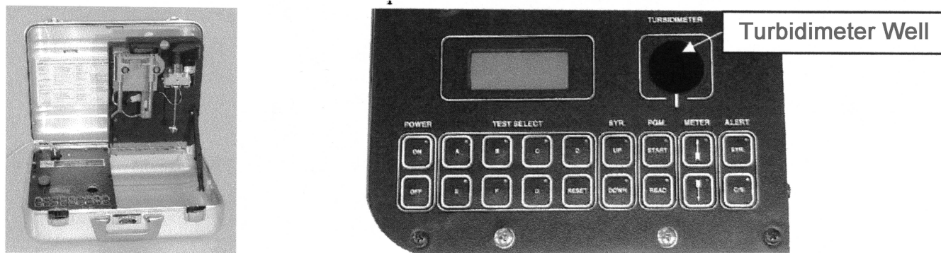
FIG. 1 Micro-Separometer Mark V Deluxe and Associated Control Panel

NOTE 2—The Mark X has a universal power supply and requires only one power cord as compared to the Mark V Deluxe that requires individual power cords for different voltages.