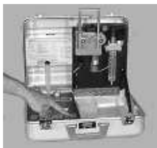
FIG. 5 Meter Adjust

10.11.1 The automatic program starts with a read meter indication (four short tones) followed by a 2 s to 30 s adjustment period. During this period, the turbidimeter will automatically adjust to 100. If the adjustment cannot be completed at this time, the ERROR ALERT will illuminate and an ERR-04 will be displayed.