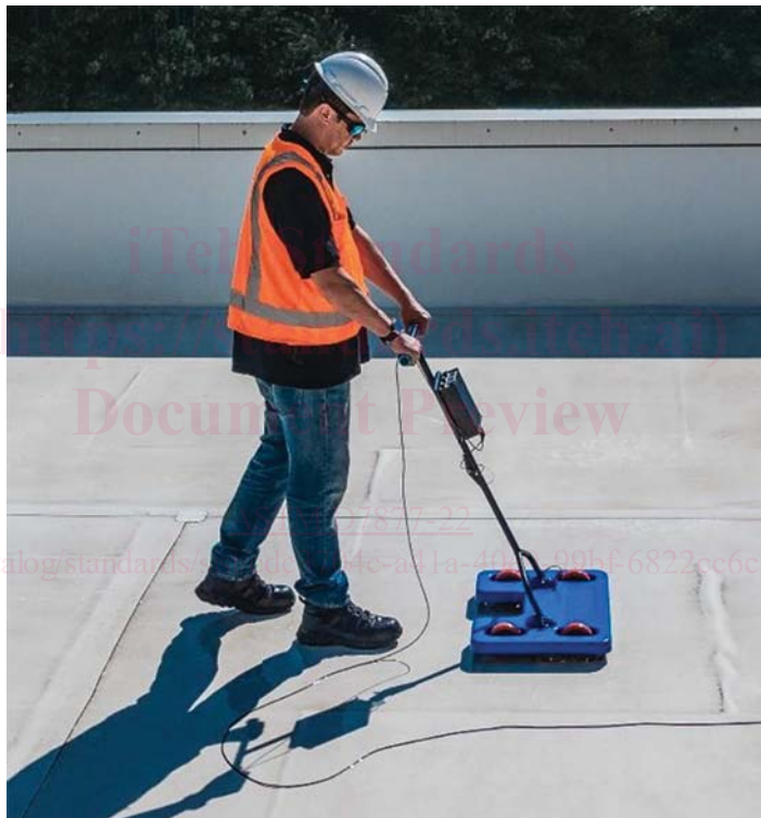
FIG. 2 Testing a Membrane with a Scanning Platform

forms a continuous perimeter around the platform with the inner sweep contained within the perimeter of the outer sweep. 6