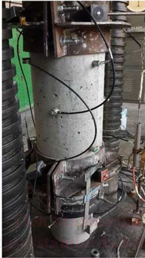
FIG. 2 Reinforced Column Specimen During Compression Testing