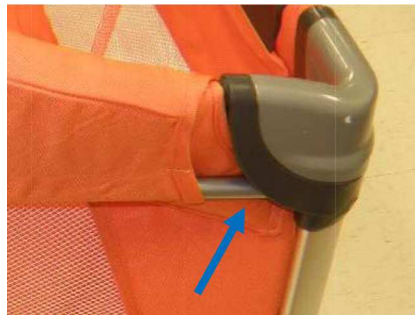
FIG. 1 Example of Bedside Sleeper Accessory Attachment Component

This specifically excludes positions that the manufacturer shows in a like manner in its literature to be unacceptable, unsafe or not recommended.