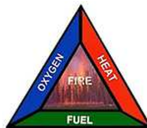
FIG. 3 The Fire Triangle

©NFPA, reproduced with permission. Text ©ASTM International 2014.