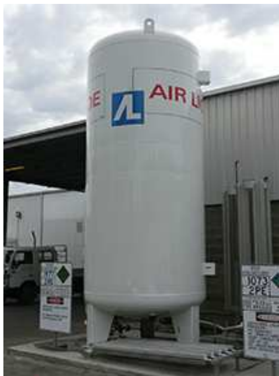
FIG. 2 Cryogenic Oxygen Storage

8.4 The ability to support and enhance combustion after ignition is the hazard associated with an oxygen-enriched atmosphere. The risk to people and property that accompanies this hazard is variable. Sometimes the human risk is grave; sometimes the economic risk is severe. In these instances, the need to prevent combustion is imperative. Occasionally the