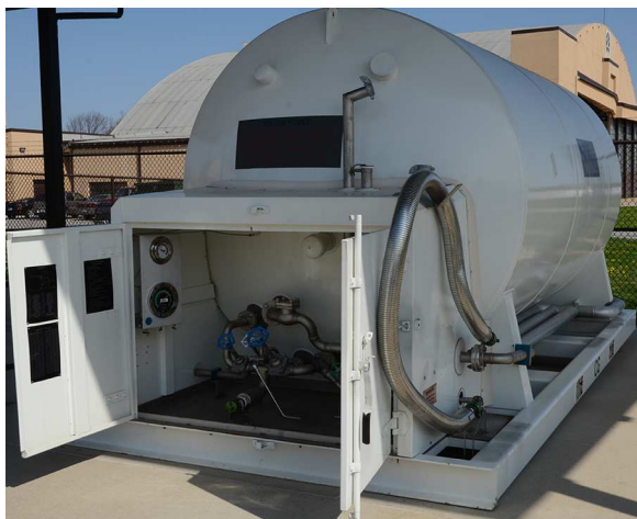
FIG. 1 Skid-Mounted Cryogenic Oxygen Storage