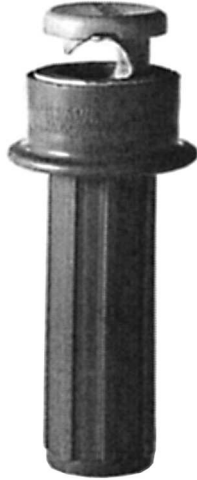
FIG. 1 Style I Clamp