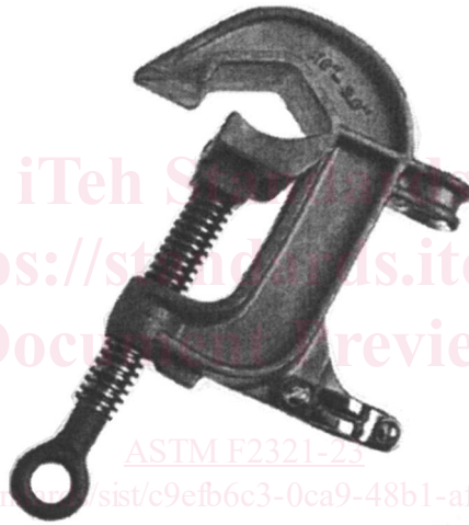
FIG. 2 Style II "C" Shape Clamp