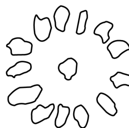
FIG. 2 Typical Injector Spray Pattern

10.3.8 Oil Temperature — 57\text{ }^{\circ}\text{C} \pm 8\text{ }^{\circ}\text{C} ( 135\text{ }^{\circ}\text{F} \pm 15\text{ }^{\circ}\text{F} ).