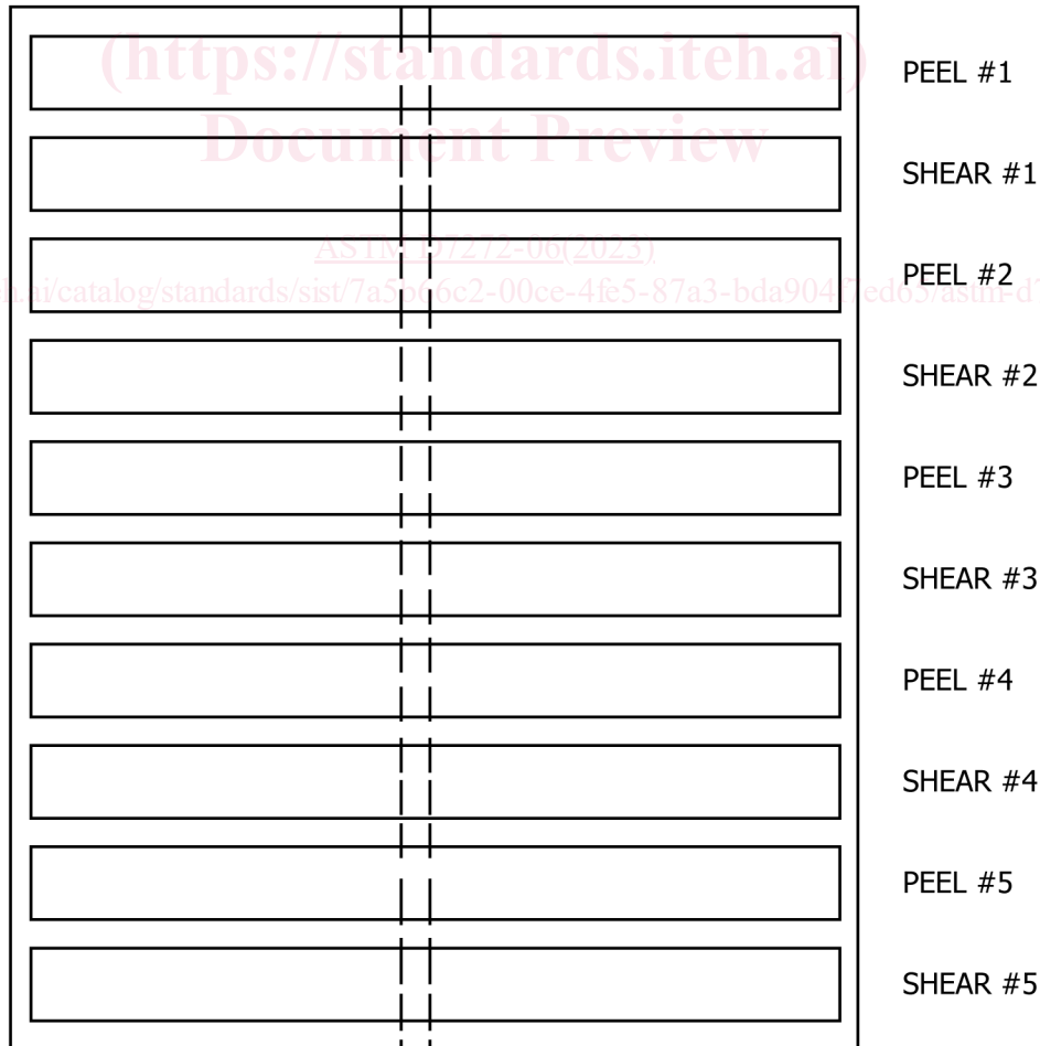
FIG. 1 Seam Sample

7.2 Shear Testing —Subject five specimens to the shear test (see Fig. 2). Fully support the test specimen within the grips across the width of the specimen. The seam samples shall be tested in accordance with Test Method D882. The samples shall be 25 mm (1 in.) wide by 50 mm (2 in.) greater than the width of the seam. The cut shall be centered over the seam, perpendicular to the centerline of the seam. Grip separation shall be 50 mm (2 in.) plus the width of the seam. The samples shall be tested at a crosshead speed of 500 mm (20 in.)/min.