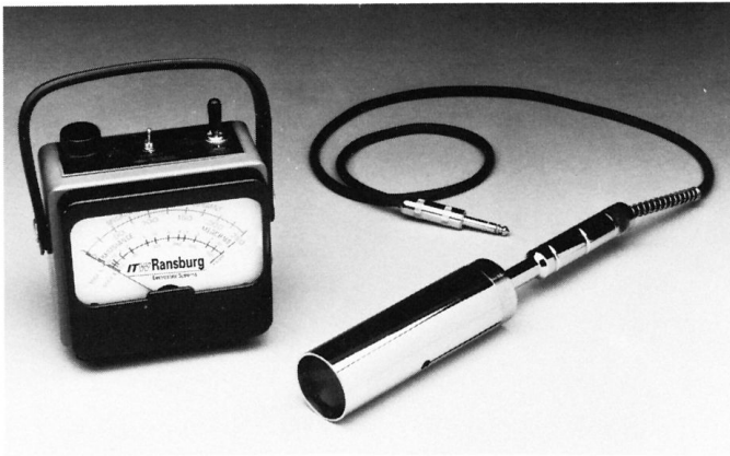
FIG. 1 Analog Paint Application Test Assembly