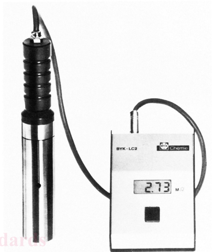
FIG. 3 Conductivity Meter

for all electrostatic applications. To provide greater accuracy in measuring low resistance paints, the meter is equipped with dual range selection. Range “A” is .005 to 1 \text{M}\Omega , Range “B” is .05 to 20 \text{M}\Omega . The original version of this device was an analog instrument with a pointer and scale as shown in Fig. 1 and many such instruments are in use. It has been replaced by a digital version, a diagram of which is in Fig. 2.