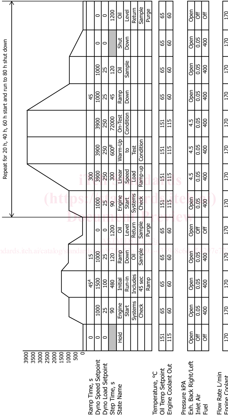
TABLE 7 Sequence IIH Control States