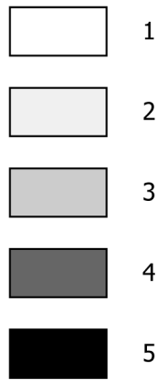
FIG. 3 Color Browning Chart

NOTE 8—The objective of this test is to evaluate steam generation capability on repeated bake cycles. Usage expectation is that a rack oven is ready for immediate use after removal of prior product. For simplicity, the test is performed with an empty oven.