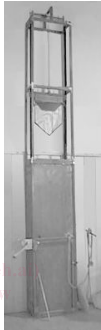
FIG. 1 Drop Test Machine

6.5 The test frame is equipped with a measuring device to control the drop height as measured from the lowest tip of the panel specimen to the floor. The drop height is measured to the nearest 1/8 in. (3 mm).