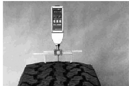
FIG. 5 Measuring the Tread Radius Using the Three-Point Drop

7.2.4 The cured cord angles shall be 90 ± 2° for the carcass and 21.0 ± 2° for the belts.