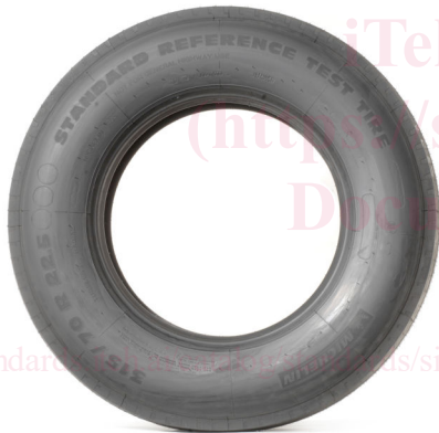
FIG. 2 Side View of the 315/70R22.5 154/150L Radial Truck Standard Reference Test Tire