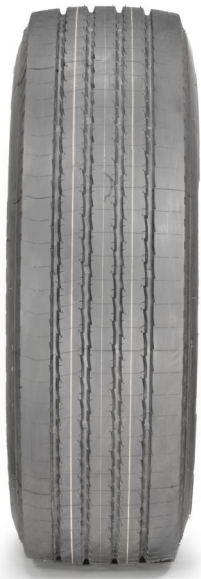
FIG. 1 Front View of the 315/70R22.5 154/150L Radial Truck Standard Reference Test Tire