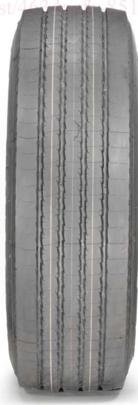
FIG. 1 Front View of the 315/70R22.5 154/150L Radial Truck Standard Reference Test Tire

https://standards.iteh.ai/catalog/standards/sist/46344078-2515-40d2-805a-a4a38c270dc1/astm-f2870-23