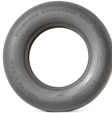
FIG. 2 Side View of the 315/70R22.5 154/150L Radial Truck Standard Reference Test Tire