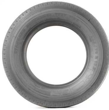
FIG. 2 Side View of the 245/70R19.5 136/134M Radial Truck Standard Reference Test Tire

4.3 The tire used for this specification is produced by Manufacture Francaise des Pneumatiques Michelin. 4 The tire is stamped on the sidewall with the words: “Standard Reference Test Tire” and “F2871”.