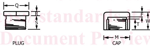
TABLE 2 Dimensions of Plugs and Caps, in. A