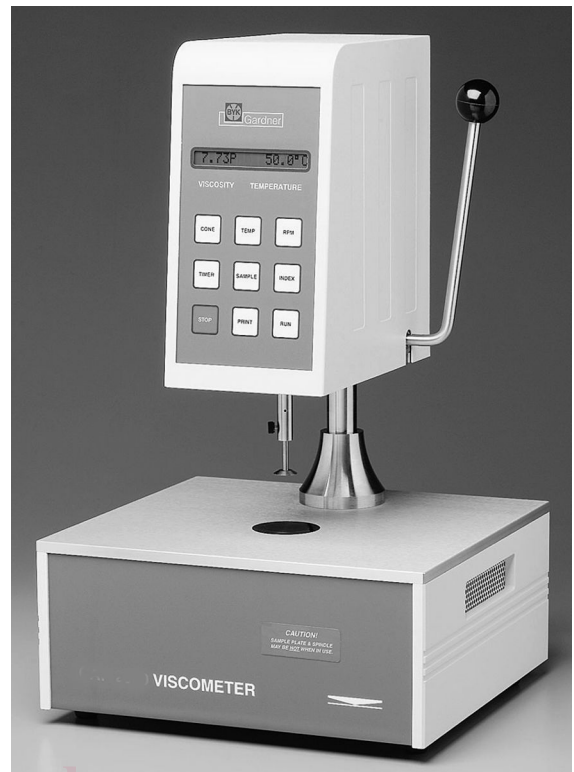
FIG. 2 Digital Cone and Plate Viscometer