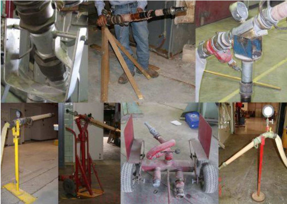
FIG. 2 Typical Hose Mounting Methods

( https://standards.iteh.ai ) Document Preview