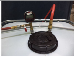
FIG. 4 Fitting and Closure Final Assembly

7.2.2.5 Fill the container as full as possible without the closure in place (see Fig. 5).