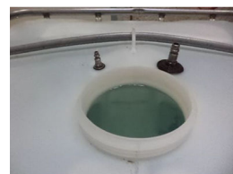
FIG. 3 Quick Connect Fitting Locations