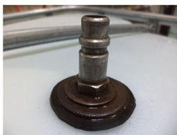
FIG. 2 Water Inlet Quick Connect Fitting

7.2.2.4 Connect the water supply line to the water inlet fitting (see Fig. 3 and Fig. 4).