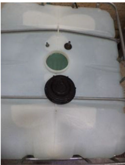
FIG. 5 Sample Fill Level and Preparation

8.2 After the container has been sealed (in accordance with the proper closing instructions) and as much air as possible has been removed from the test sample, start pressurizing.