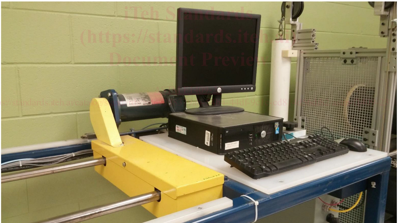
FIG. 3 Motion Drive and Data Collection Computer

from the population shall be established by testing it to a 90 % confidence level within 5 % of the mean.