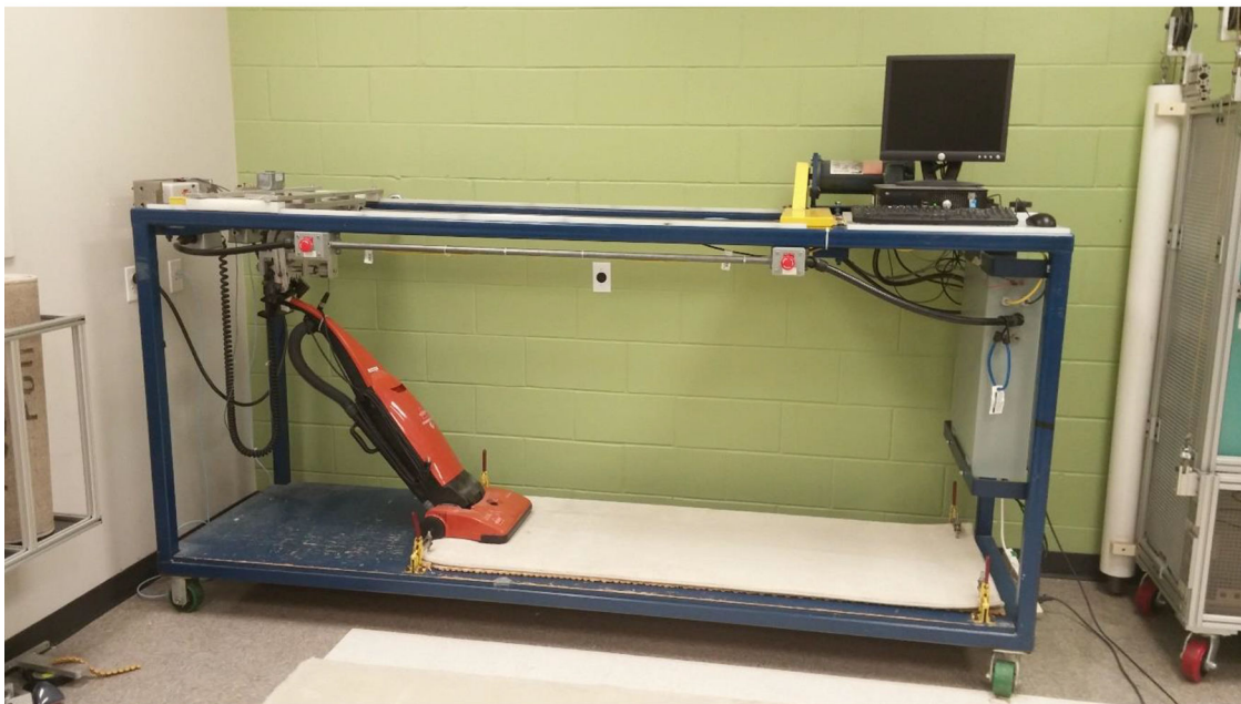
FIG. 1 ASTM Mobility Equipment

https://standards.iteh.ai/catalog/standards/astm/788379ab-54b4-44df-9c1c-cd814d56d182/astm-f1409-23