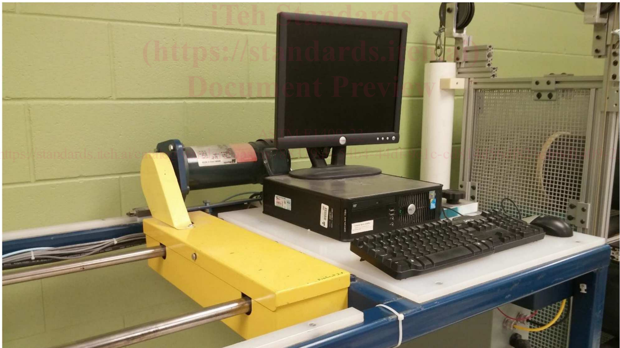
FIG. 3 Motion Drive and Data Collection Computer

4.3 The relation between actual vacuum cleaner usage and the method of operation is valid only if the vacuum cleaner user operates the vacuum cleaner properly and in accordance with the manufacturer's instructions.