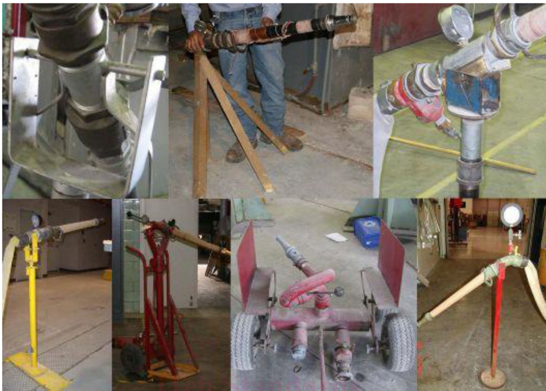
FIG. 2 Typical Hose Mounting Methods