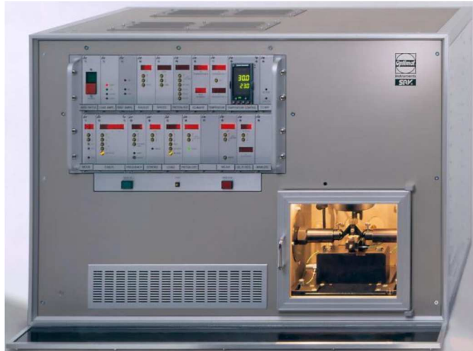
FIG. 1 SRV Test Machine (Model III)

lubricant between them. Test load is increased in 100 N increments until seizure occurs. The load, immediately prior to the load at which seizure occurs, is measured and reported as O.K.-load, which can be converted in Hertzian contact pressures.