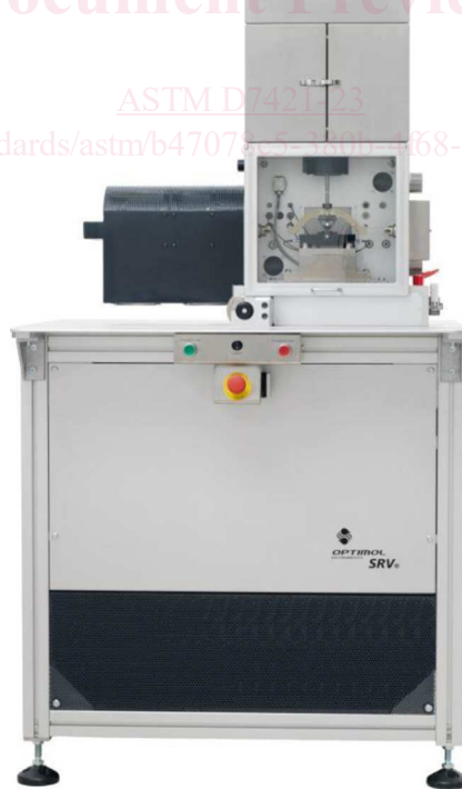
FIG. 3 SRV Test Machine (Model IV)

https://standards.itih.ai/catalog/standards/astm/b4707/68-a719-68af4b1f80a9/astm-d7421-23