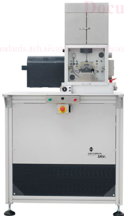
FIG. 3 SRV Test Machine (Model IV)

be determined by four values, 24 mm ± 0.5 mm diameter by 7.85 mm ± 0.1 mm thick: