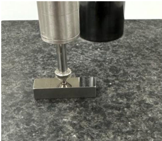
FIG. 1 Comparator Stand Fixture