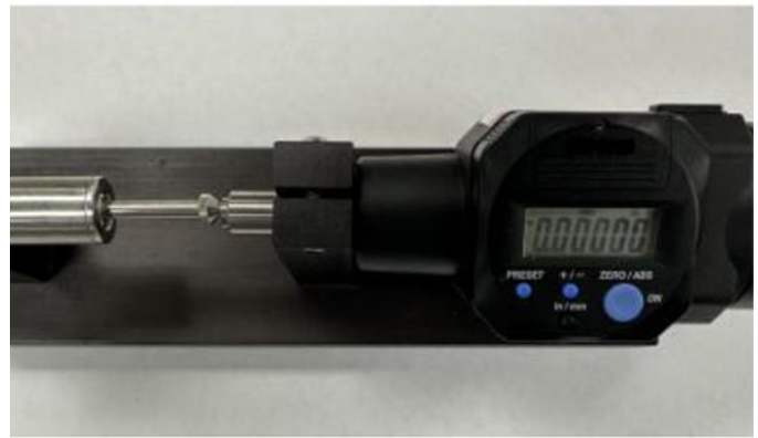
FIG. 2 Micrometer Fixture

7.1.1 This practice involves electrical equipment. Verify that all electrical wiring is connected properly and that the power supply and signal conditioner are grounded properly to prevent electrical shock to the operator. Take necessary precautions to avoid exposure to power signals.