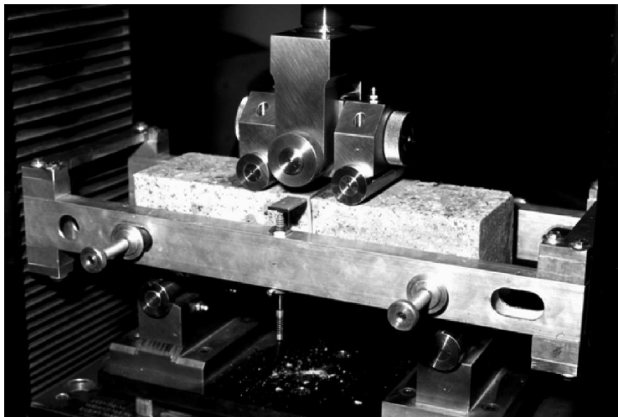
FIG. 1 Arrangement to Obtain Net Deflection by Using Two Transducers Mounted on Rectangular Jig Clamped to Specimen Directly Above Supports

NOTE 6—For X-Y plotters, accurate determination of the area under the load-deflection curve and the loads corresponding to specified deflections is only possible when the scales chosen for load and deflection are reasonably large. A load scale chosen such that 25 mm [1 in.] corresponds to a flexural stress of the order of 1 MPa [150 psi], or no more than 20 % of the estimated first-peak strength, is recommended. A recommended deflection scale is to use 25 mm [1 in.] to represent about 10 % of the end-point deflection of 1/150 of the span, which is 2 mm [0.08 in.] for a 350 mm by 100 mm by 100 mm [14 in. by 4 in. by 4 in.] specimen size, and 3 mm [0.12 in.] for a 500 mm by 150 mm by 150 mm [20 in. by 6 in. by 6 in.] specimen size. When data are digitally stored, the test parameters may be determined directly from the stored data or from a plot of the data. In the latter case, use a plot scale similar to that recommended for an X-Y plotter.