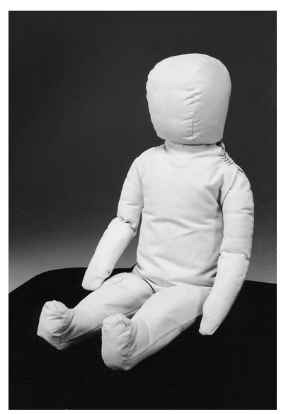
FIG. 1 CAMI Infant Dummy, Mark II