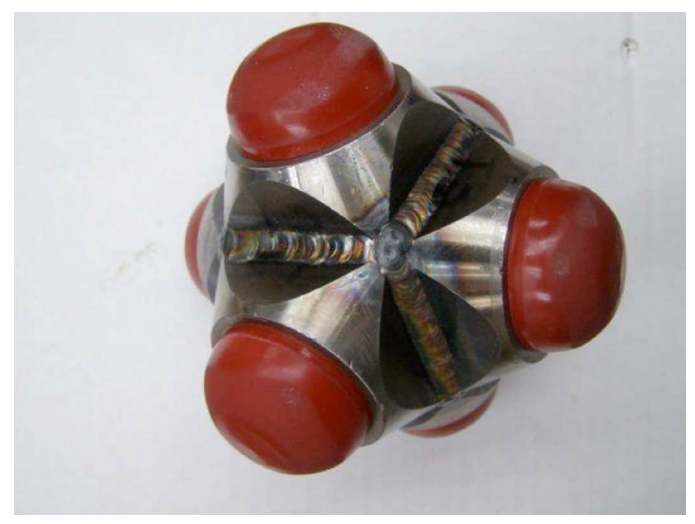
FIG. 3 8.4 lb Commercial Hexapod Tumbler

6.1.3.3 Hexapod Tumbler Feet Specifications (see Fig. 5)—Tumbler Feet parameters are: