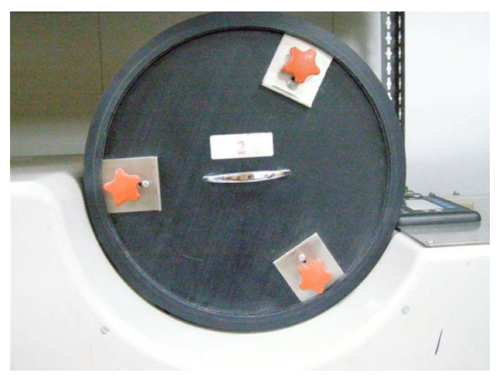
FIG. 1 Typical Front View of Drum Cover

NOTE 1—The 2.8 lb Residential Hexapod Tumbler is recommended for residential pile floor covering test applications and the 8.4 lb Commercial Hexapod Tumbler is recommended for commercial pile floor covering applications.