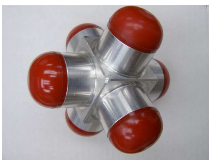
FIG. 4 2.8 lb Residential Hexapod Tumbler