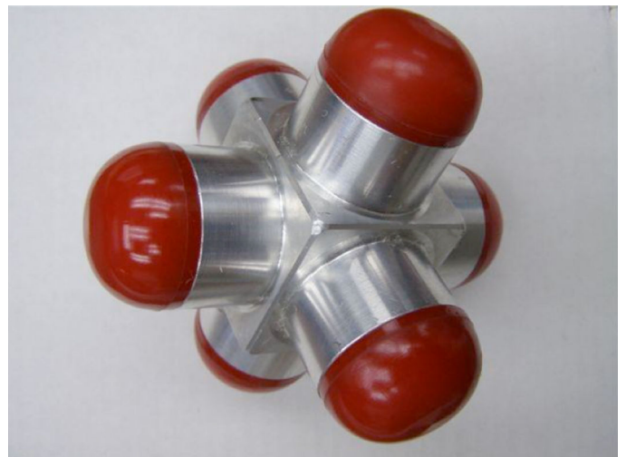
FIG. 4 2.8 lb Residential Hexapod Tumbler

6.1.3.1 8.4 lb Commercial Hexapod Tumbler —Comprised of a steel (or other suitable material) 2.0 in. \pm 0.04 in. (50 mm \pm 1 mm) cube with 1 in. (25 mm) thick plates welded to each side. The outside corners are welded such that when the studs are fitted and the hexapod placed on a flat surface, no metal touches the flat surface. The total length of any axis, not including hexapod feet, should be 3.8 in. \pm 0.08 in. (96 mm \pm 2 mm). Replaceable tumbler feet (see 6.1.3.3) are screwed centrally into each face. The specified total mass of Commercial Hexapod Tumbler with six feet installed is 8.4 lb \pm 0.2 lb (3810 g \pm 90 g). A photograph of a typical 8.4 lb Commercial Hexapod Tumbler is shown in Fig. 3.