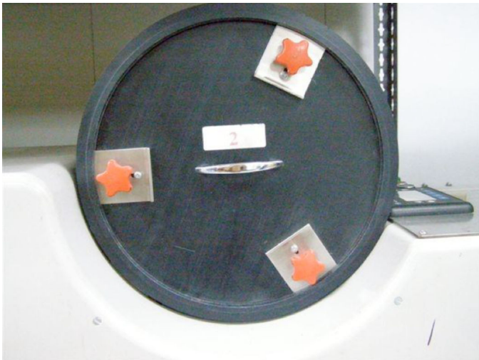
FIG. 1 Typical Front View of Drum Cover