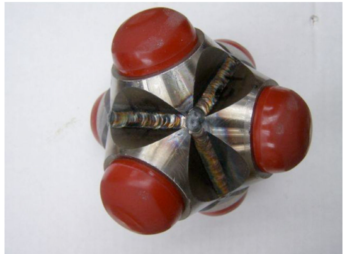
FIG. 3 8.4 lb Commercial Hexapod Tumbler