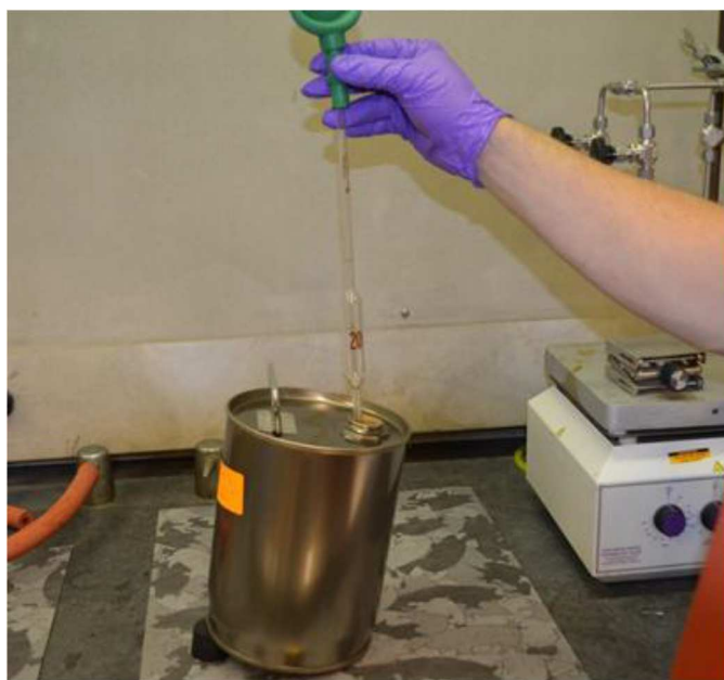
FIG. 2 Draining of Sample Container with No Spout

a corner so that the buffer solution collects beneath the sample container opening. Tap the side or corner a few times lightly on a benchtop to encourage the buffer solution to collect. Wait approximately 30 s. Transfer the buffer solution with a clean, 20 mL (or larger) pipette. Wait an additional approximate 30 s and repeat to ensure all the buffer solution is delivered to the 4 L beaker. Set the pipette aside for later use; do not clean. Lay the pipette down horizontally with no contact to the tip so that any residual buffer solution is not lost.