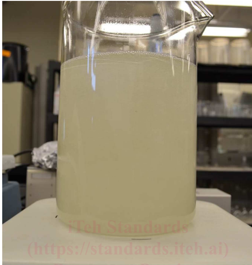
FIG. 5 Adequate Stir Speed (that is, Bars No Longer Visible)