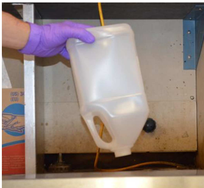
FIG. 1 Draining of Sample Container with a Spout

12.7.2 If the sample container does not have a spout and cannot be effectively drained, tilt the sample container to the side or to