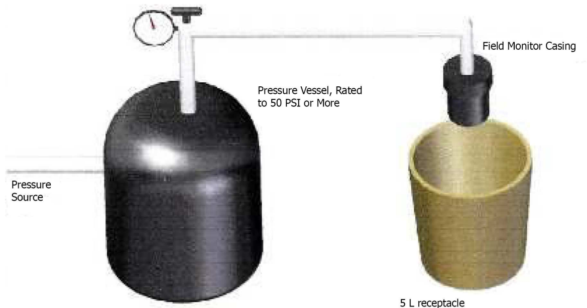
FIG. 1 Test Apparatus for Seal Assessment: All Components to be Electrically Bonded Together and Grounded

7.2.5 A field monitor casing so constructed that a perfect seal is made between its upper part and the top of the field monitor and also between its lower part and the bottom of the field monitor.