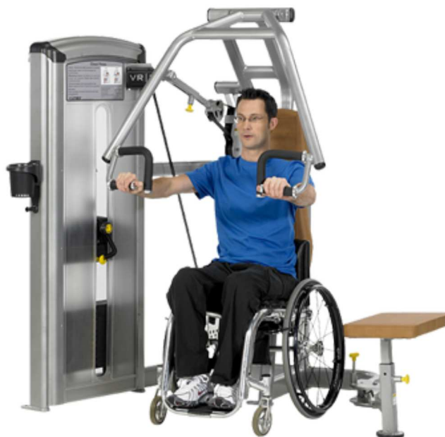
FIG. 2 Example of a Movable Seat

5.1.2.7 Removable/movable seats shall have appropriate mechanisms, for example, wheels or skids and hand grips or gripping surfaces, to enable the seat to move easily over different floor surfaces and a means of preventing unintentional movement during use (see Fig. 2). Seats which retain no permanent fixing to the equipment once removed shall have a hand grip(s) in an appropriate