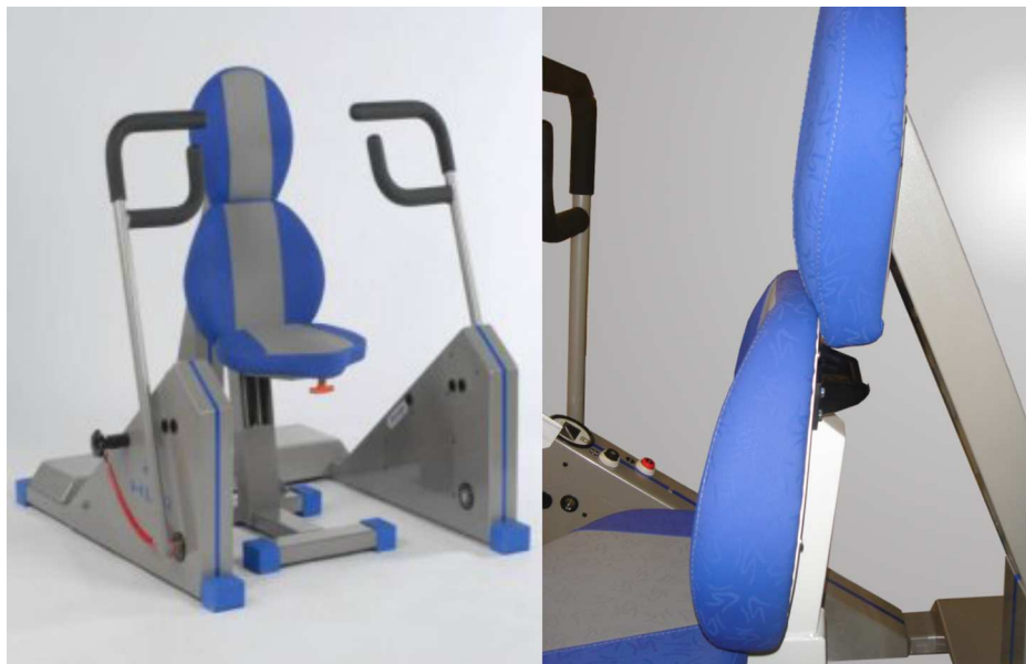
FIG. 3 Example of a Physical Locating Mechanism

5.1.3.1 Adjustment mechanisms required for set up shall be visible in a clear line of sight to the user when approaching the