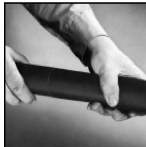
FIG. 2 Apply Adhesive to all Butt Joints Installed/Existing Pipe Work