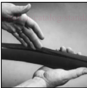
FIG. 3 Apply Unslit Insulation to Straight Pipe

together at each end – working toward the center. Seal all butt joints, cut outs and termination points with adhesive.