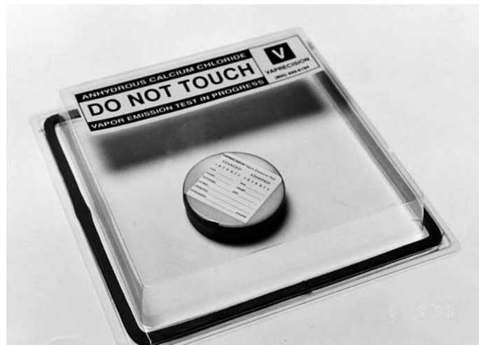
FIG. 2 Anhydrous Calcium Chloride Test

7.7.4.1 One cylindrical plastic container of anhydrous calcium chloride with a cover area of 6 in 2 (40 cm 2 ) ± 10%. The anhydrous calcium chloride shall be tape-sealed in the container against moisture or heat-sealed in an air-tight bag to prevent moisture absorption (Fig. 2). The mass of the container, the anhydrous calcium chloride, and the tape seal shall be 30 g ± 10%.