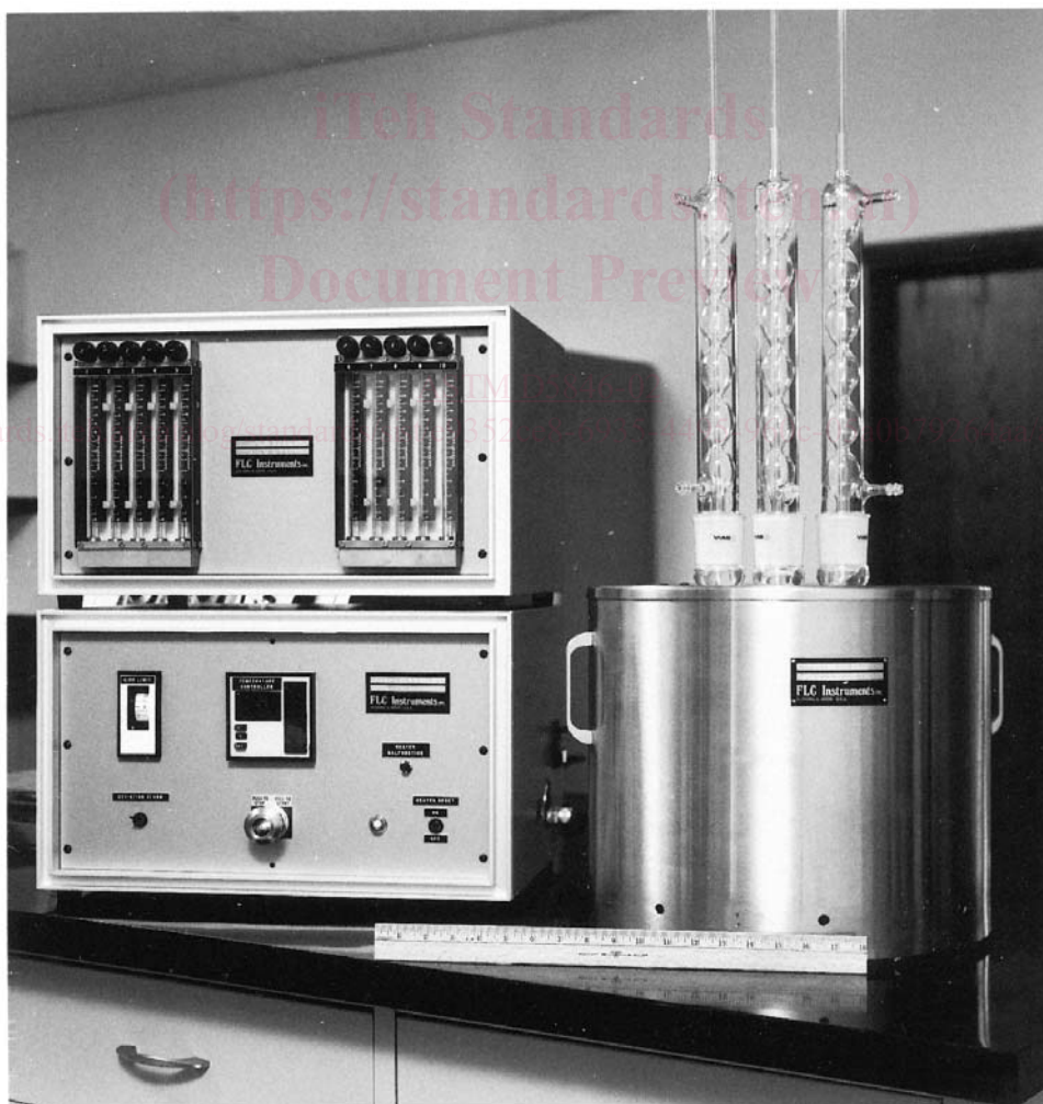
FIG. 1 Apparatus, Showing Gas Flow Control System, Temperature Control System, and Heating Block

6.3.2 Flowmeters shall have a scale length sufficiently long to permit accurate reading and control to within 5 % of full scale.