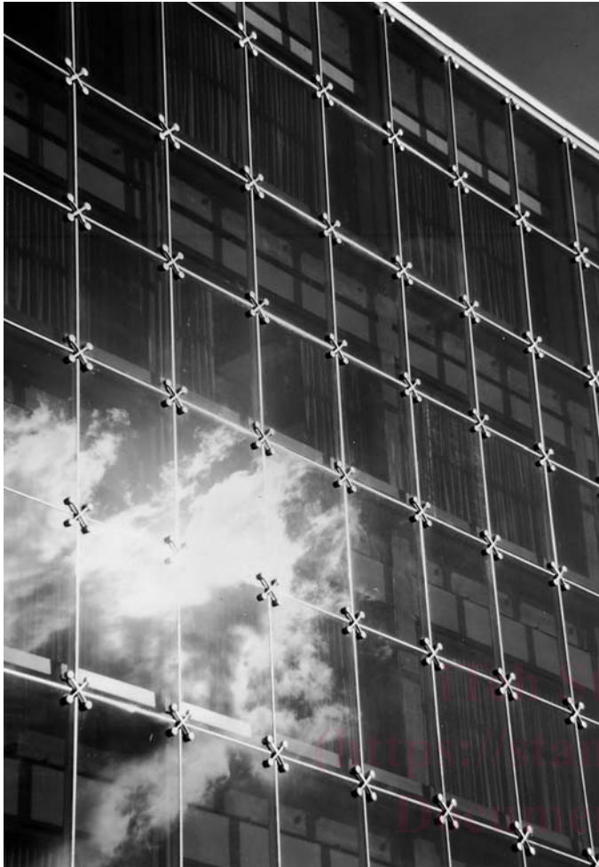
FIG. 5 Four-Side SSG System

mullion caps, thermal stressing of a glass lite is reduced since there is no shading of the glass edge by the cap, and wind load induced stressing of the lite is more evenly distributed to the metal framing system by a structural glazing sealant, thus reducing the possibility of localized cracking of glass.