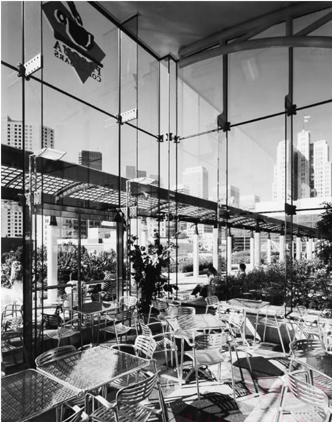
FIG. 7 Glass Mullion System

framing system and various available finishes, glass types, various panel materials, structural and weather seal sealants, and accessory materials. These sections are not all-inclusive and do not describe other components that are known to be incorporated occasionally into SSG systems.