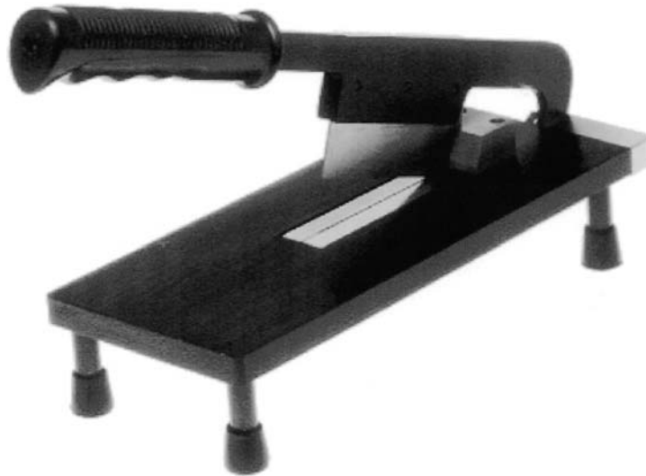
FIG. 3 Guillotine