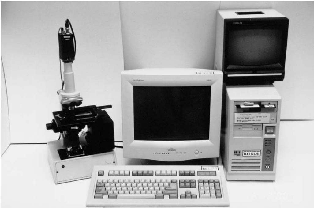
FIG. 1 The Optical Fiber Diameter Analyser