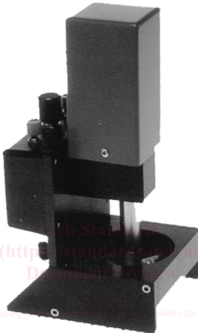
FIG. 5 Slide Spreader

holes in the side of the box and over the top. The coring tube is thrust through the holes in the top to sample the wool.