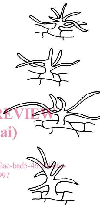
Figure A.2 — Elemicin-sabinene-type tarragon

iTeh STANDARD PREVIEW (standards.iteh.ai)