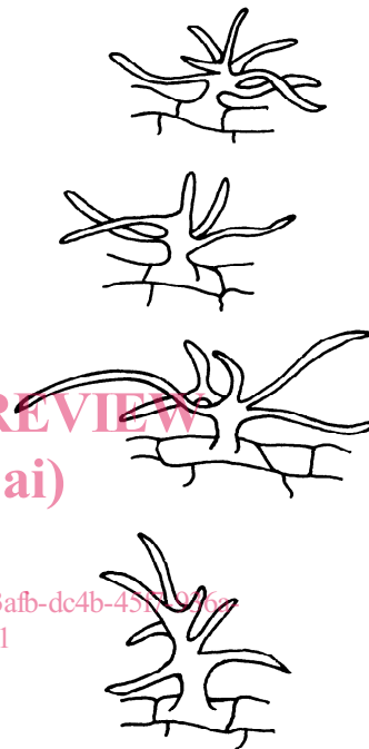
Figure A.2 — Elemicin-sabinene-type tarragon

iTeh STANDARD PREVIEW (standards.iteh.ai)