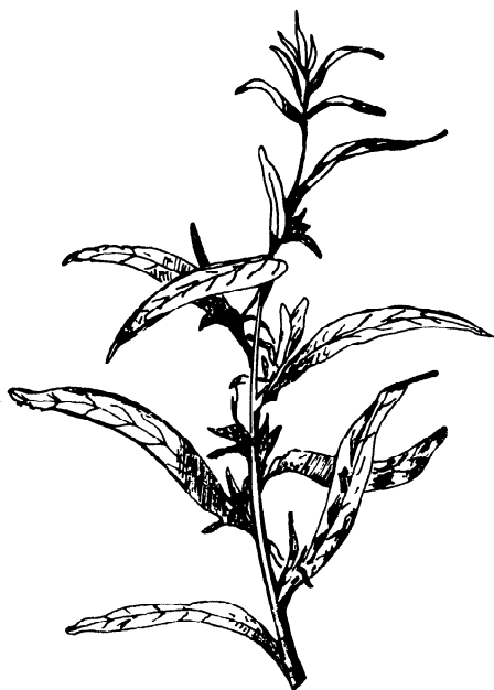
Figure 1 — Tarragon — Stem with leaves