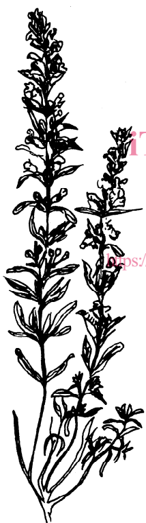
Figure 2 — Sprig of winter savory