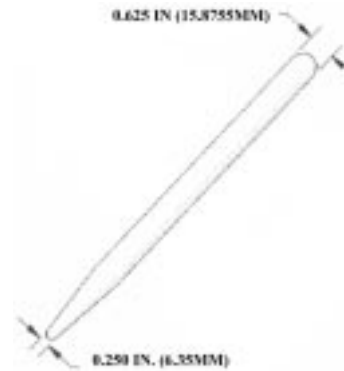
FIG. 1 Probing Tool

7.1.2 Technique 1 —Using the probing tool, depress the center of the sealant bead to create an elongation strain on the sealant joint. Record the depth of the depression as a percent-