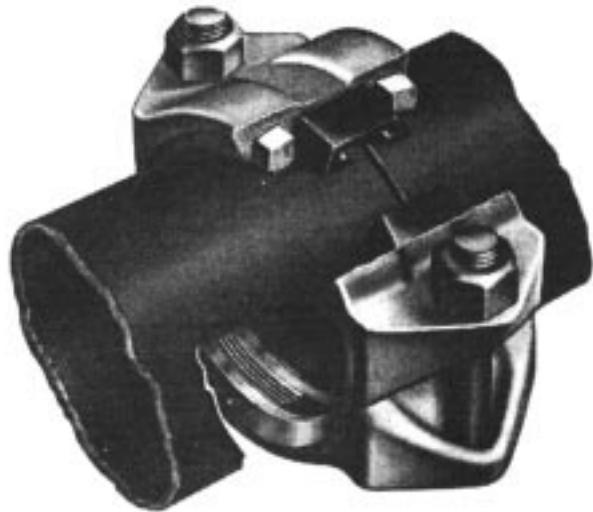
FIG. 2 Type II—Class 1 Typical Construction

3.1.9 joint —interface formed between pipe and pipe, pipe and fitting, or fitting and fitting where a GMC is used to seal