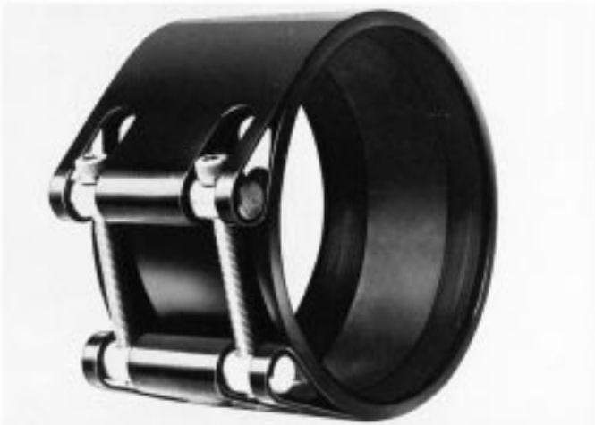
FIG. 3 Type II—Class 2 Typical Construction

within a specified working pressure this interface and where applicable, provide mechanical holding strength.