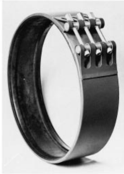
FIG. 4 Type II—Class 3 Typical Construction

Housings shall be constructed of iron-chromium-nickel alloy in accordance with Specification A 743/A 743M, Grade CF-8 or Grade CF-8M.