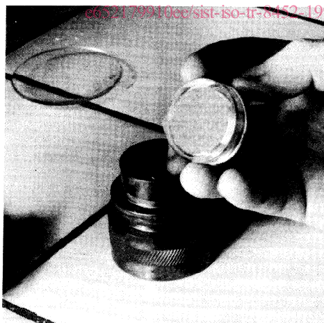
Figure A.3 — Underside of the tablet on which the reflectance measurements are taken

SIST ISO/TR 8452:1995 https://standards.iteh.ai/catalog/standards/sist/753f48e1-7b2d-456d-bdeb-c6521709306c/sist-iso-tr-8452-1995