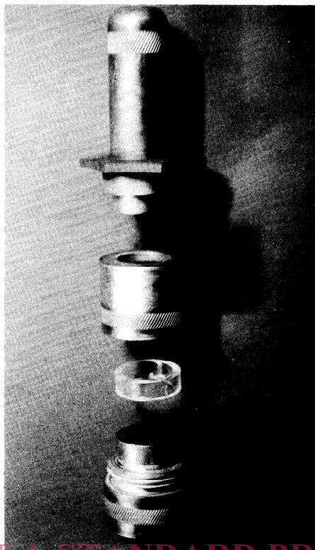
Figure A.2 — Apparatus for making powder tablets (standards.iteh.ai)

SIST ISO/TR 8452:1995 https://standards.iteh.ai/catalog/standards/sist/753f48e1-7b2d-456d-bdeb-c6521709306c/sist-iso-tr-8452-1995