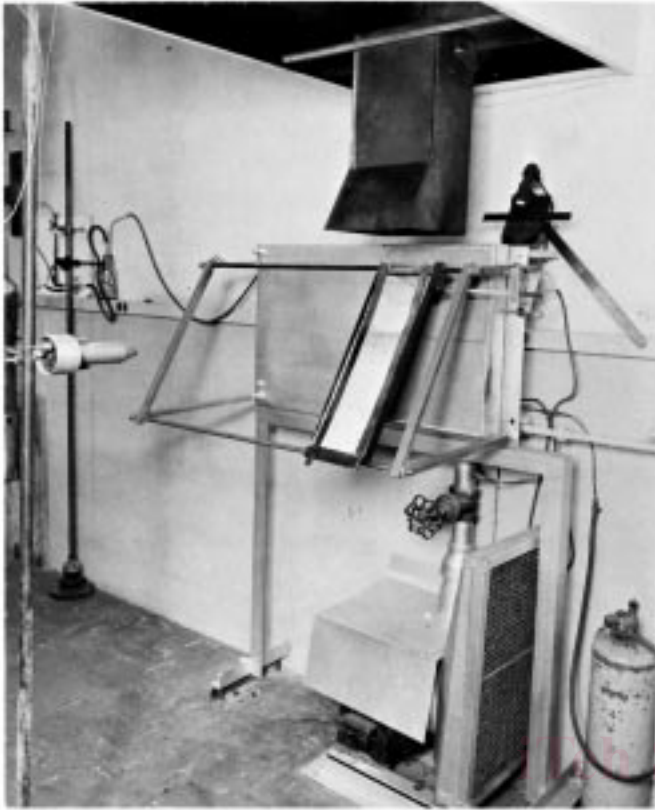
FIG. 1 Radiant Panel Flame Spread Test Equipment

a pressure of 2.8 in. of water (700 Pa); an air filter to prevent dust from obstructing the panel pores; a pressure regulator and a control and shut-off valve for the gas supply.