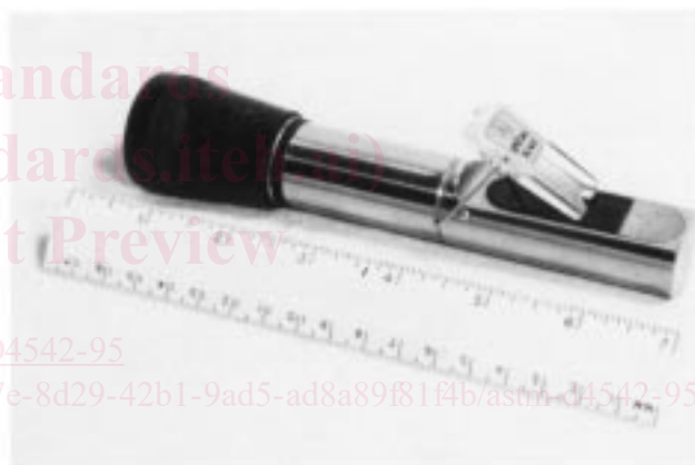
FIG. 1 Typical Hand-Held Refractometer

4.1 Refractometer —A temperature compensated refractometer scaled to either index of refraction or ppt (parts per thousand). A typical hand held refractometer is shown in Fig. 1.