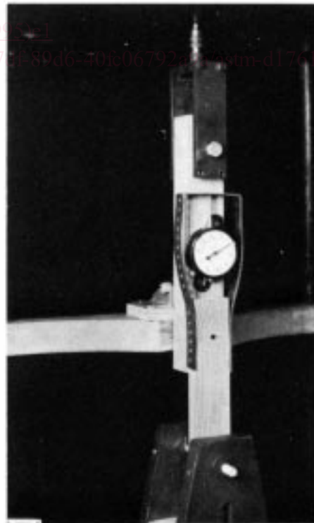
FIG. 2 Assembly for Lateral Resistance Test of Nails, Staples, or Screws

18.3 Weight and Moisture Content —Weigh the two wood members of each specimen before assembly and before the